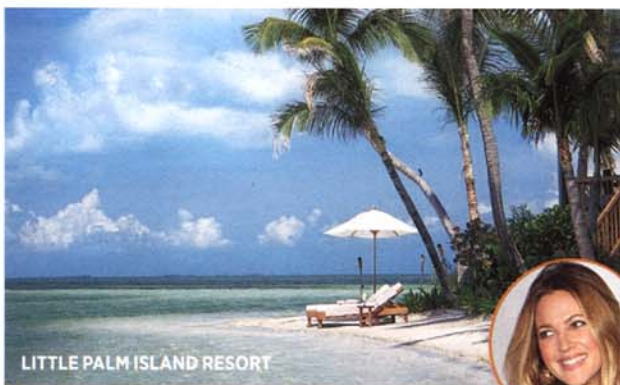
LITTLE PALM ISLAND RESORT