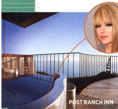
POST RANCH INN